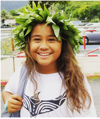
Kira 'Aul'ii Tai Hook TODDLER MOANA