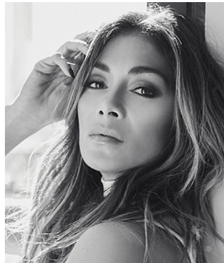
Nicole Scherzinger SINA