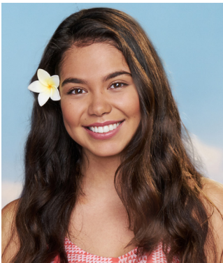
Auli'i Cravalho MOANA